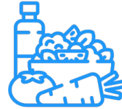
Food and biomass